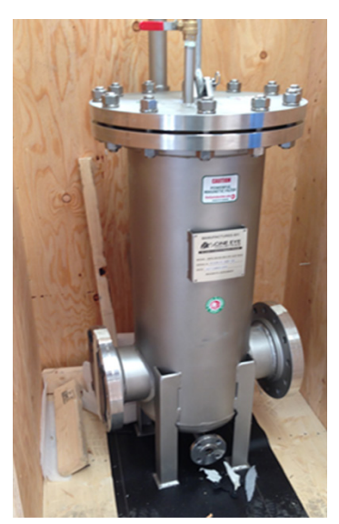
Figure 3: BPS System pre-installation.