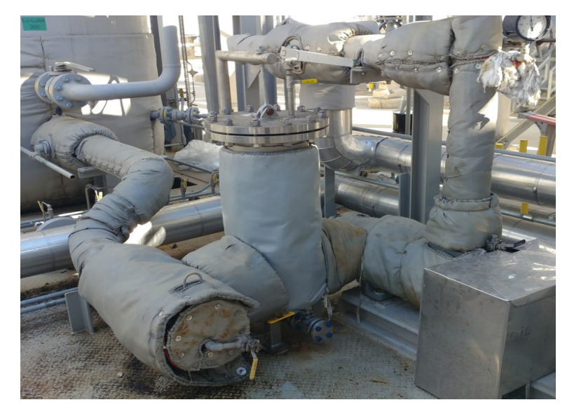
Figure 4: BPS System installed.

BPS designed and manufactured an inline magnetic separator to capture the black powder down to and below sub-1 micron in the lube oil system. The system was installed immediately upstream of an IMO pump. The goals of installing the magnetic separator were: (1) eliminate the presence of black powder in the lube oil system, (2) reduce wear and tear on the compressors and pumps, (3) extend the life of the pumps and compressors, and save on maintenance and replacement costs, and finally (4) improve on the performance of the conventional filtration system to reduce costs related to replacement filter cartridges. Targa installed this unit in their lube oil system in 2017, and only during 2018 and 2019 (year to date) have the impacts been fully realized.