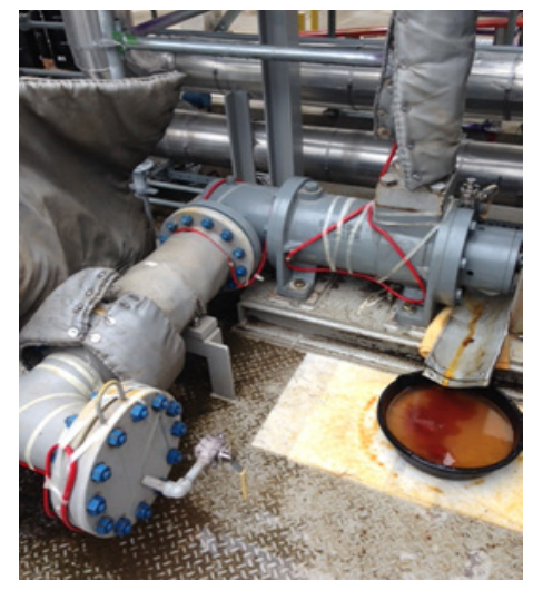
Figure 2: Compressor lube oil system before installation.

At Galena Park, low ethane propane (LEP) vaporizes in the flash tanks prior to ship loading operations, and the vapor is subsequently compressed by large Howden compressors and chilled to convert it back into LEP liquid for future sale. The compressors utilize injected oil as a sealing mechanism to reduce slip and to increase efficiency. The black powder in the LEP vapor was contaminating the compressor lube oil, thereby reducing its effectiveness and not only impacting compressor operations but the IMO lube oil pumps. The conventional filtration system was ineffective at capturing the black powder, particularly the particles below 10 microns in size.