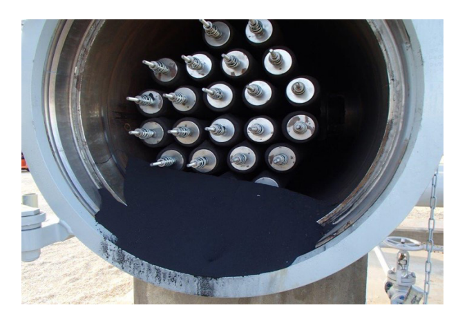
Figure 1. Uncaptured black powder built up in a conventional filter housing.

Targa was experiencing high levels of Black Powder<sup>™</sup> (black powder) contamination at its Galena Park terminal in purity NGL products and loading, vapor handling and facility lubrication systems. Black powder is a type of particulate contamination that is common in hydrocarbons and it consists of both ferrous and nonferrous elements and compounds, in varying amounts, typically in high concentrations of particles under 10